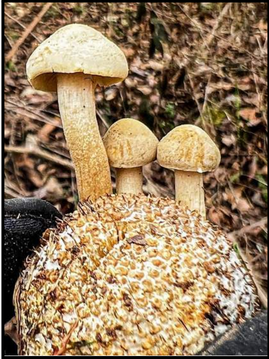
Left: Agrocybe species on a Sycamore seedpod Bottom: Neofavolus species