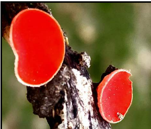
Sarcoscypha species