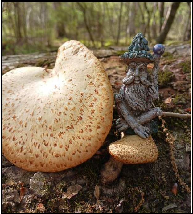
Cerioporus squamosus