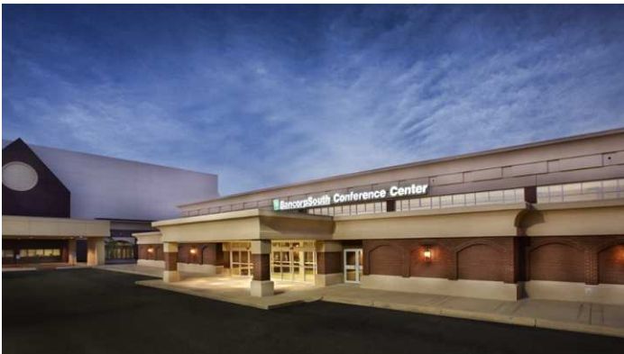
BancorpSouth Conference Center

The 2019 annual meeting will be conducted August 9-11 in Tupelo, Mississippi at the BancorpSouth Conference Center (375 East main Street, Tupelo, MS 38804; www.BCSArena.com ) which is next door to our host hotel the Hilton Garden Inn (363 East Main Street, Tupelo, MS 38804; (662) 718-5500); www.Tupelo.HGI.com ). SCTA's group rate is $119 (code SCTA) and will be available until July 10, 2019. The HGI will provide conference patrons with a 20% discount coupon for breakfast. You are urged to make your reservations now. It is all happening in the heart of historic downtown Tupelo.