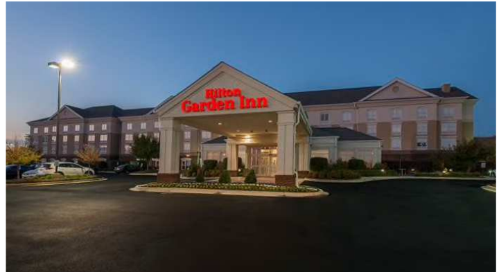
Hilton Garden Inn – Tupelo

The meeting registration form was not available for this newsletter but will be emailed soon and posted on www.SouthernChristmasTrees.org and Facebook pages: "Southern Christmas Tree Association" and "Southern Christmas Tree Growers". Please check the website regularly for updates.