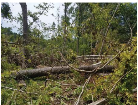
We helped this landowner salvage timber damaged by a windstorm. The landowner will reinvest the timber sale revenue to make improvements of turkey habitat and security measures.