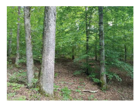
FMS helped this landowner receive more than $4,000/acre for their timber in north Alabama. White oak prices remain extremely high at this time.