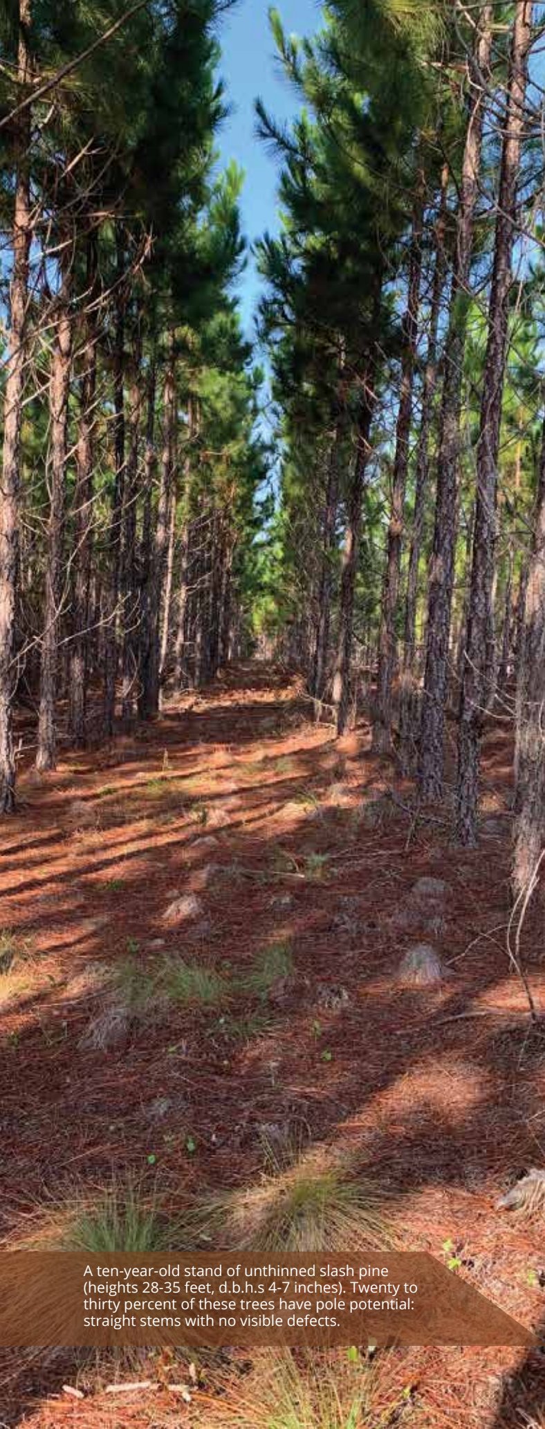
A ten-year-old stand of unthinned slash pine (heights 28-35 feet, d.b.h.s 4-7 inches). Twenty to thirty percent of these trees have pole potential: straight stems with no visible defects.

age), tree species, genetics, stocking, site quality, and management intensity. Most stands begin producing poles in well-managed stands at 30 years of age but pine poles in Georgia have been produced as early as age 25 years and 22 years for pilings (down to a 9-inch diameter at 4.5 feet above groundline or d.b.h.) with proper and timely thinnings.