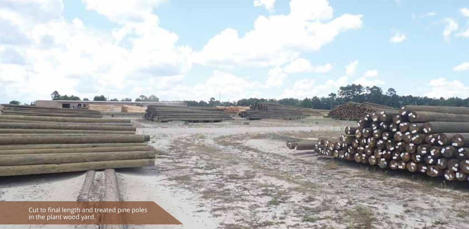
Cut to final length and treated pine poles in the plant wood yard.