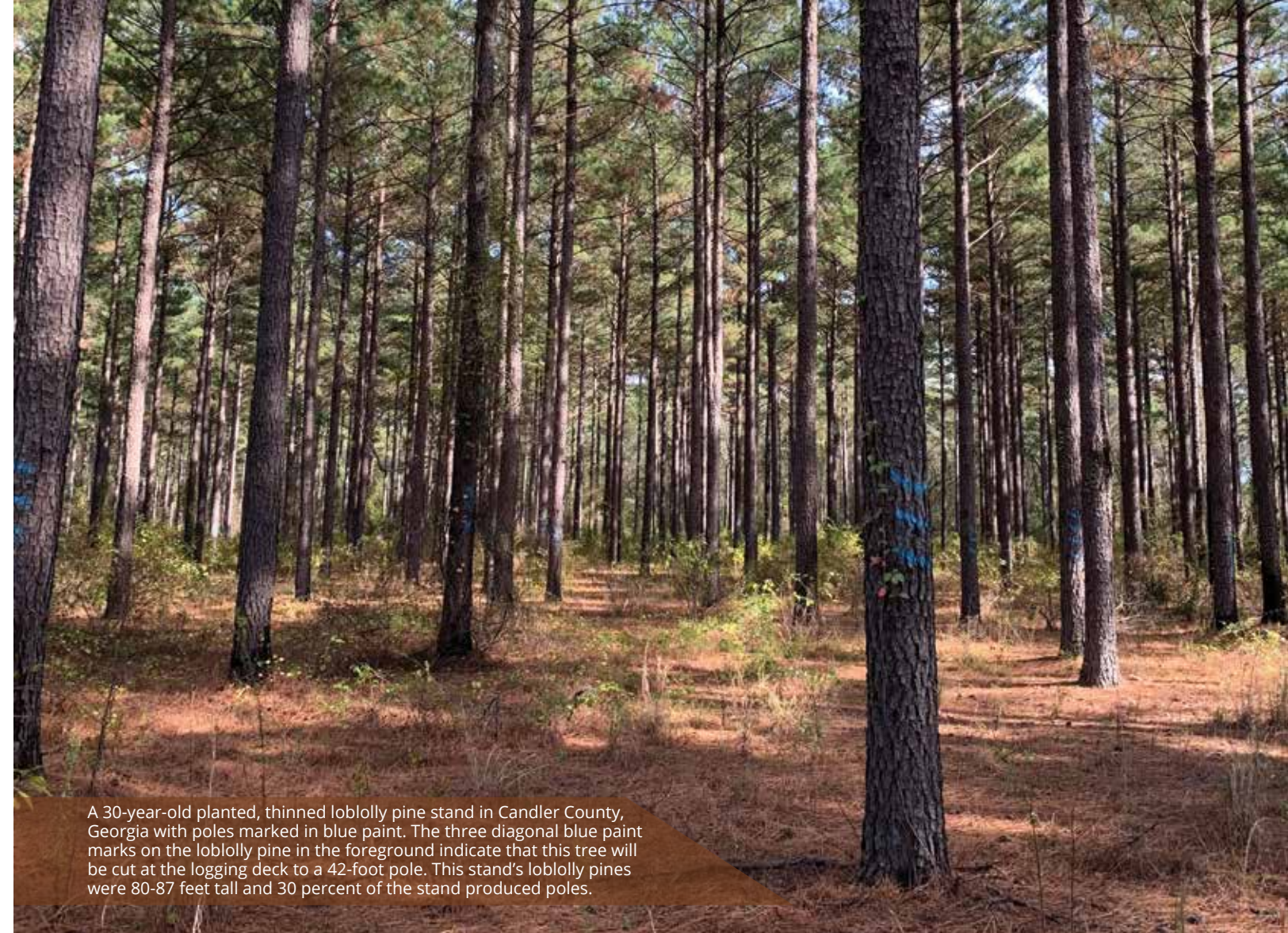
A 30-year-old planted, thinned loblolly pine stand in Candler County, Georgia with poles marked in blue paint. The three diagonal blue paint marks on the loblolly pine in the foreground indicate that this tree will be cut at the logging deck to a 42-foot pole. This stand’s loblolly pines were 80-87 feet tall and 30 percent of the stand produced poles.

Planted pine stands usually are thinned at age 12- to 22-years old based on site quality, pine species/genetics, and management intensity. As a pine stand’s basal area increases above 120 ft 2 /acre, bark beetle hazard potential increases. As live crown ratio decreases below 40 percent, the growth