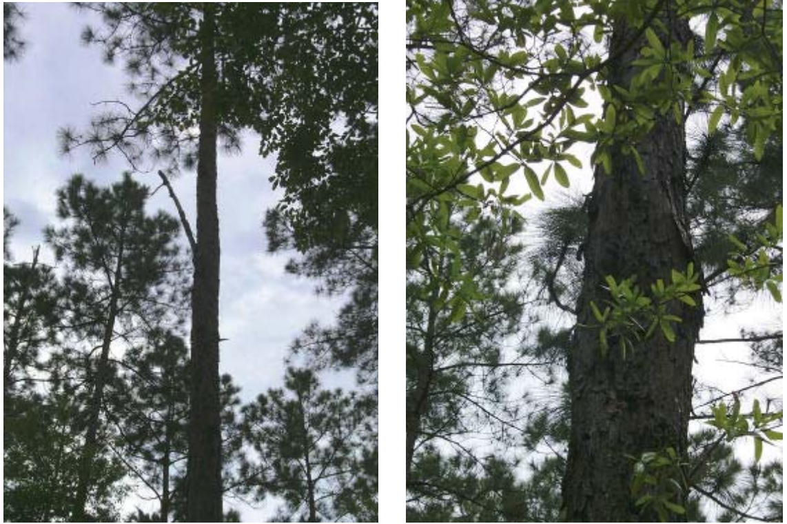
Photos 5 and 6. Examples of steep branch angle and a stem canker that would make that part of the stem not usable for a pole (stem below the steep branch or canker may qualify as a pole if there is enough length and no other defects).