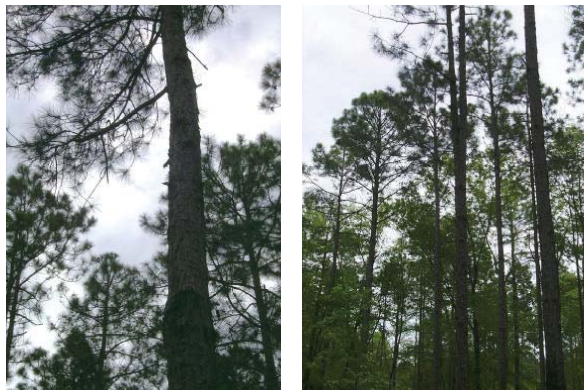
Photos 3 and 4. Examples of excessive sweep and a fork defect (stem up to fork could be used as a pole).