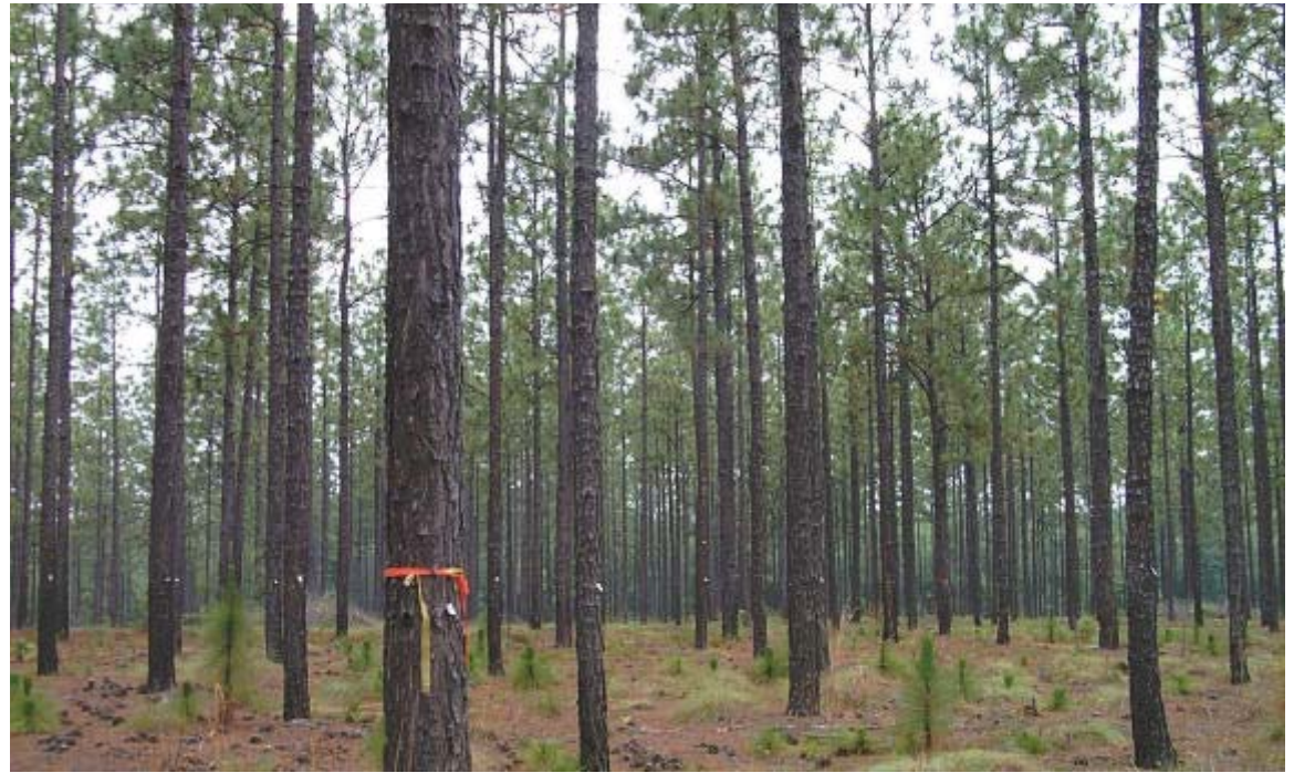
Photo 1. Longleaf stand (38-years-old) on the Sand Hills State Forest in Chesterfield County, SC, thinned twice growing on excessively well drained low fertility deep sand. Stand has been producing pine straw and is anticipated to produce some poles and quality sawtimber.