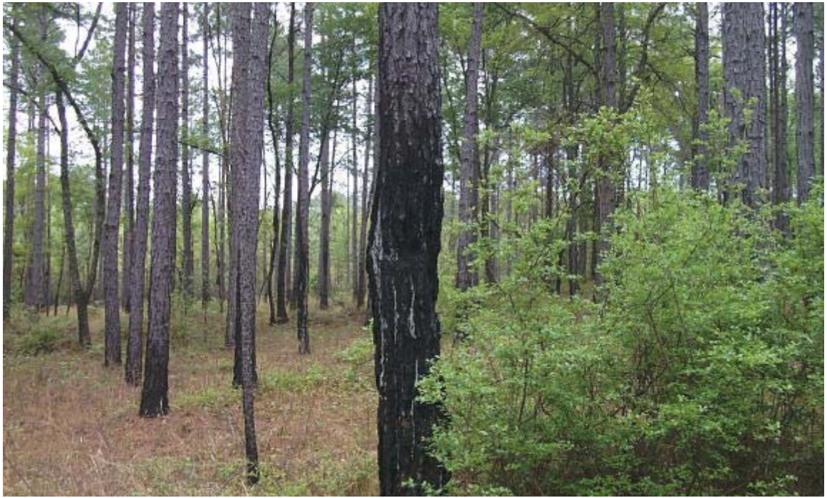
Photo 2. A managed slash pine stand (approximately 30-years-old) in Treutlen County, GA. The stand has been thinned with the objective of growing high valued sawtimber and poles. Note the stem cankered tree in the foreground that would need to be cut above the canker to possibly produce a pole. Note also the kack of branches the first 15 to 20 feet due to stand age, species, and management.