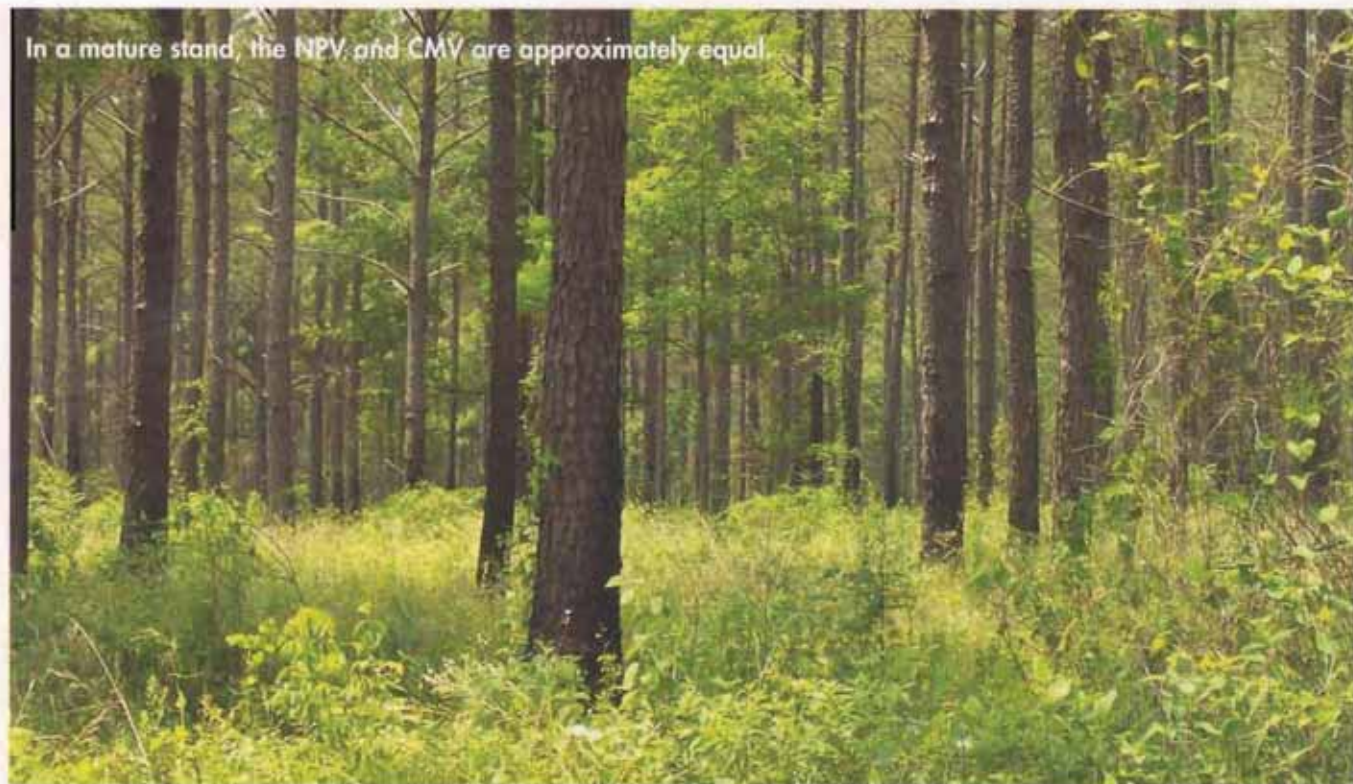
In a mature stand, the NPV and CMV are approximately equal.

The next time you are wondering what your timber is worth, take into consideration the Current Marketable Value of mature stands and the Net Present Value of younger stands for the true timber value.