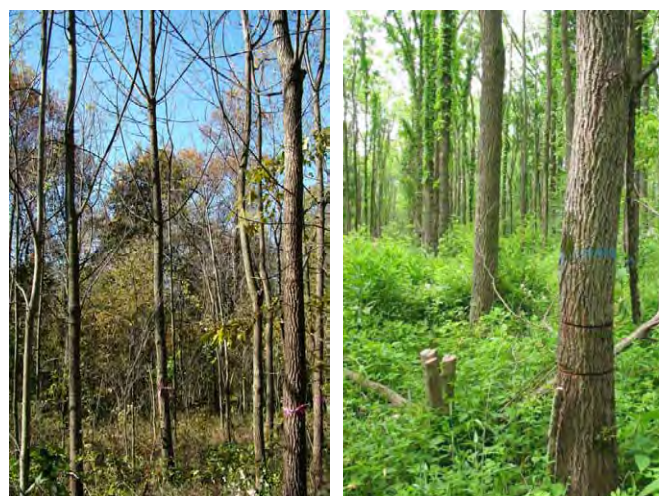
Figures 1 and 2. A good black walnut crop tree (center of figure 1) with straight stem and small side branches that can be easily pruned to produce a clean log. Girdling or felling (figure 2) can be used to release crop trees.

Stand-specific objectives drive tree selection on different parts of the property. Some areas may have a higher priority of management for wildlife or aesthetics than timber production, so different crop trees are selected. The property goals and stand objectives become an important part of the long-term management plan for your