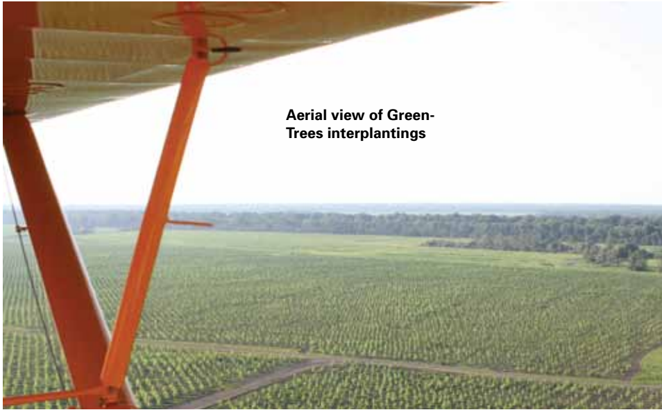
Aerial view of Green-Trees interplantings