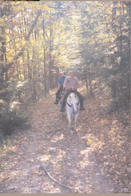
Top and Bottom: Mt. Rogers Trail Riders.